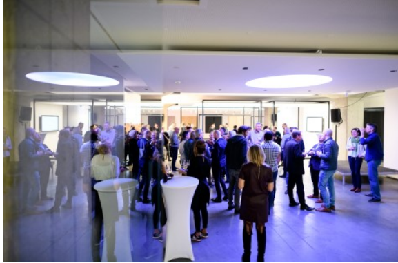
Photo 5: In the light experience space light is shown as a material and pure matter in a completely brand-neutral way.