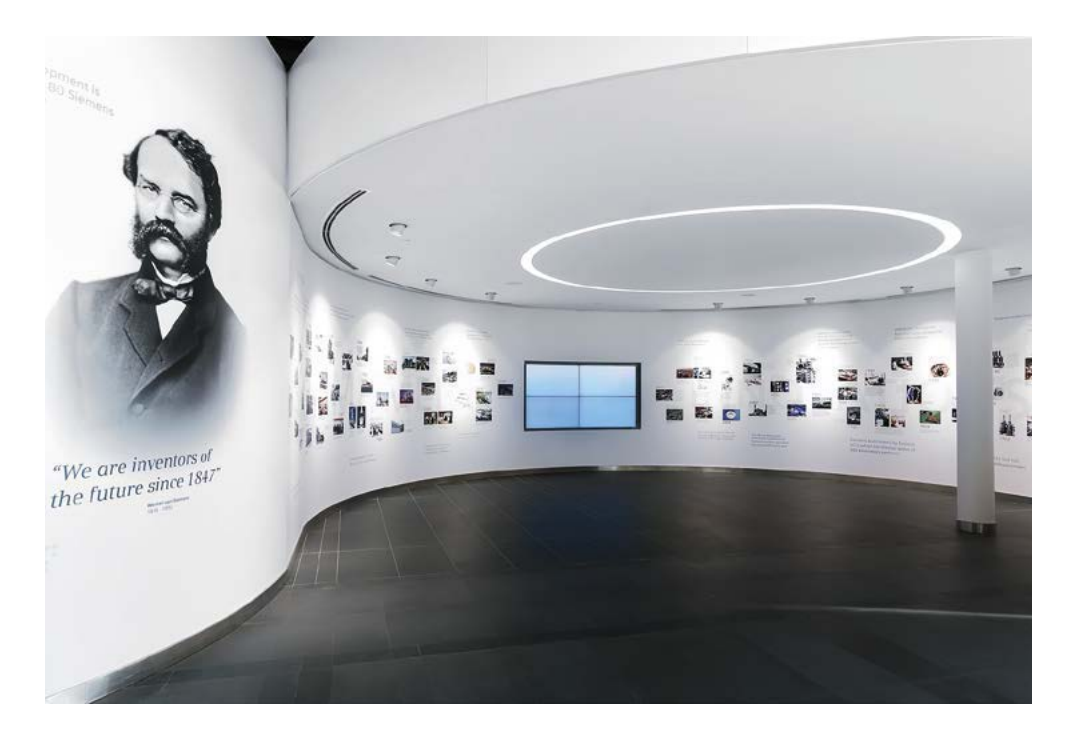
Siemens Headquarters sets a great example and is the first step towards a new future in the Middle East, which supports the UAE Vision of the Expo2020 – "Connecting Minds, Creating the Future"

"With innovative concepts like the Green Building Initiative and the energy efficiency program, Siemens Real Estate optimizes resource allocation and is making buildings more energy efficient. This applies to our construction projects and our own offices around the world. Siemens Middle East HQ are based in Masdar City Abu Dhabi, which is considered to be one of the most sustainable places on earth. In order to achieve our LEED Platinum certification, the building was designed to use 45% less energy than a typical equivalent building. The lighting solution made a significant contribution to the overall energy efficiency of the building. The eco+ label and environmental product declarations for the Zumtobel products helped us choose the right products in terms of energy efficiency, environmental relevance and application quality."