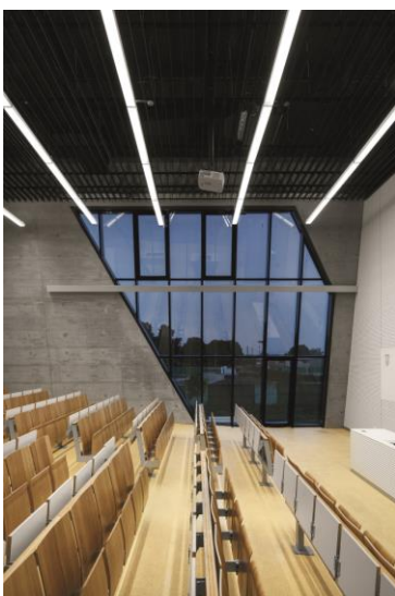
Photo 3: The lighting solutions optimise the effect of the architecture itself, while also maximising visual comfort for students and employees.

Photo 2: The architects and developers of the new Faculty of Civil Engineering in Osijek were won over by the quality, functionality and aesthetic design of Zumtobel's luminaires.