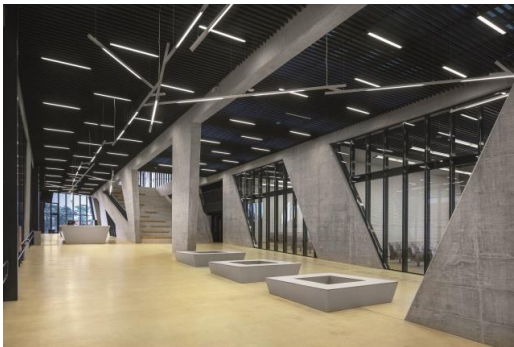
Photo 2: The architects and developers of the new Faculty of Civil Engineering in Osijek were won over by the quality, functionality and aesthetic design of Zumtobel's luminaires.

Photo 1: Zumtobel has implemented a comprehensive lighting solution throughout the new Faculty of Civil Engineering at the university in the Croatia city of Osijek by architect Dinko Peračić. They were able to utilise the know-how of its sister brand, Thorn, to realise the exterior lighting installation.