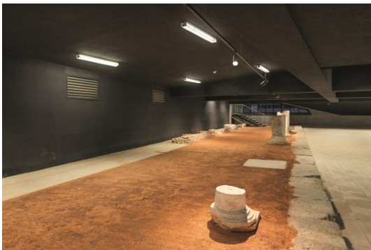
Photo 5: The building is characterised by different areas that each offer their own distinct ambience, from bright classrooms and lecture halls to an archaeological site, which is integrated in the foundations of the building.