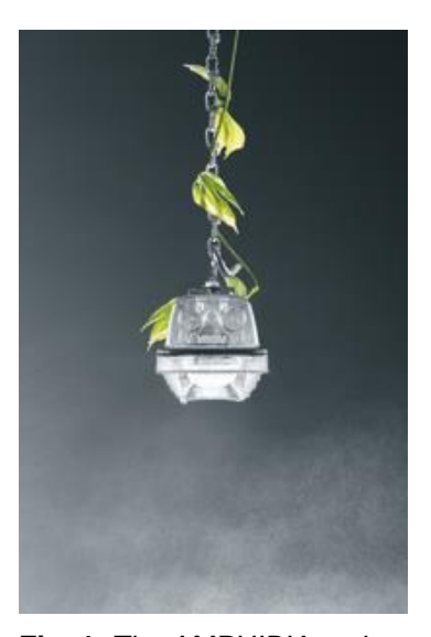
Fig. 1: The AMPHIBIA moisture-proof luminaire from Zumtobel breaks new ground in industry lighting.