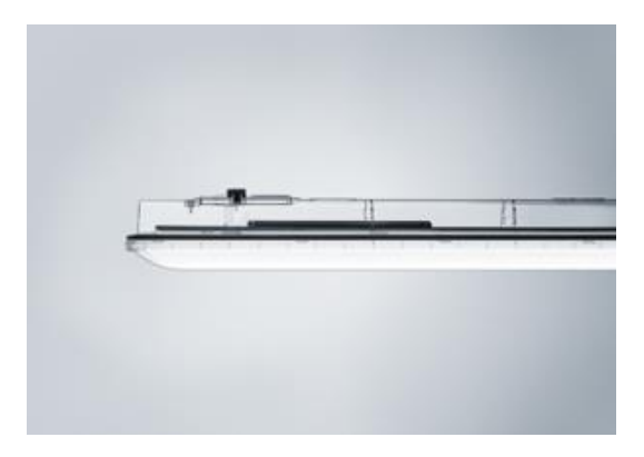
Fig. 3: Both the luminaire housing and the diffuser are made from the same high-quality material, composed of PC, PMMA or CHEMO, ensuring optimum resistance over the full lifetime of the solution.