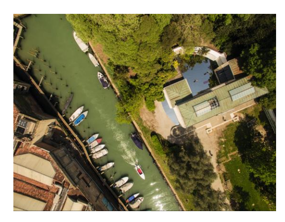
Fig. 1: As a long-standing partner of the Vorarlberg Architecture Institute and the Austrian Pavilion, Zumtobel is not only responsible for the fixed lighting solution at the pavilion, but will also continue a proud record of realizing special solutions for artists and architects.