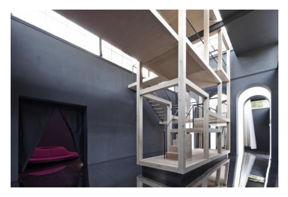
Fig. 3: Innsbruck architects LAAC push the boundaries of natural light and generate a light discourse between exterior and interior, while associates from Viennese architecture studio Henke Schreieck have installed a special object to open up the overall space.