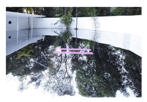
Fig. 4: Sagmeister & Walsh move away from the accepted wisdom of "form follows function" by blending beauty and practicality to form one single entity.