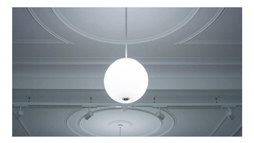
Fig. 2: Giving rooms a sense of scale – that is exactly what ALVA can do. This fitting can discretely fade into the background or present itself as a distinctive object to match the particular situation.