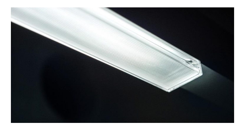
Fig. 3: FREELINE is reserved, extremely modest and inconspicuous – yet it still somehow manages to make a real visual statement. Infinite light with limits.