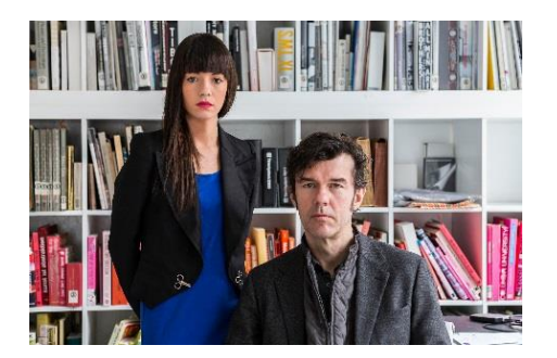
Bild 3: The New York design studio Sagmeister & Walsh has designed the 27th edition of the artistic Zumtobel Group annual report.

Bild 2: A collection of 20 typographical and socially critical A4 artistic cards forms the centrepiece of the latest annual report.