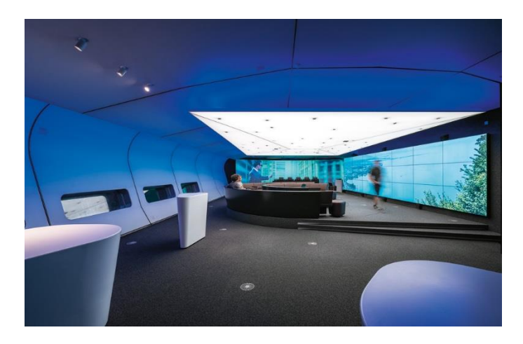
Fig. 3: Terminal V - V' stands for both "virtual" and the Austrian county "Vorarlberg" – is the VR showroom of Hefel Wohnbau, a leading general contractor for residential buildings.