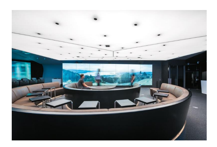
Fig. 1: Zumtobel has used a tailor-made version of the special TEELA luminaire to conjure up impressive lighting moods that suit the unique look and feel of this unique presentation space.