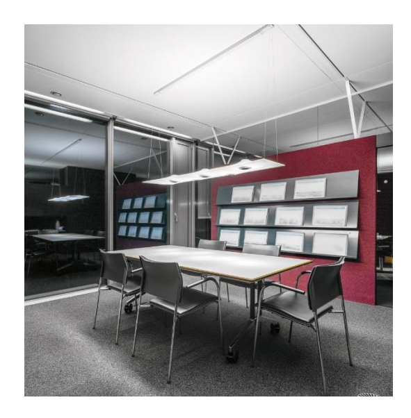
Fig. 4: The luminaire, which was developed by the renowned architectural firm Delugan Meissl in partnership with Zumtobel, is part of a new special collection: "the editions".