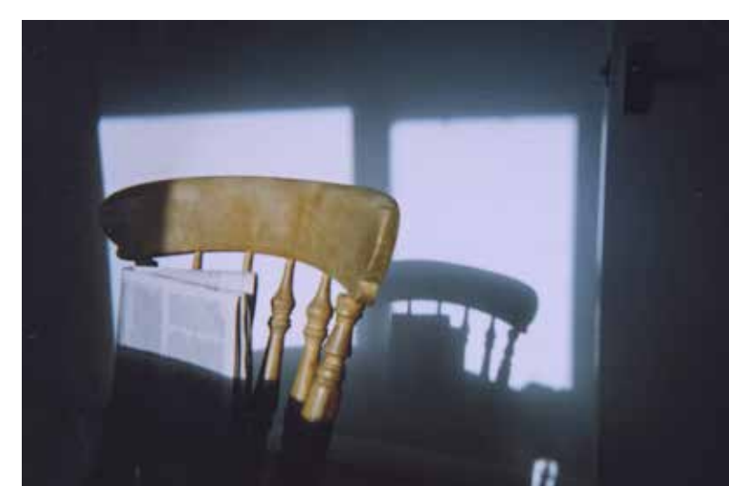
Unknown Architect Taken in Kent