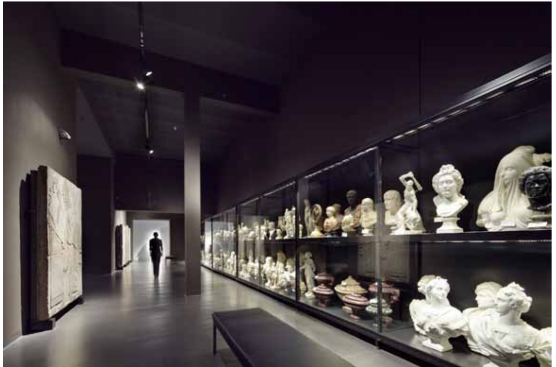
B2 | In het kijkdepot van het museum kunnen bezoekers waardevolle busten en sculpturen bewonderen. In de zeer donker gehouden ruimte plaatsen de Zumtobel spots fonkelende highlights.

From the museum lobby, visitors directly enter the sculpture hall where delicate works of art are on display. The newly designed inner courtyard is situated directly next to this hall. Staab architects have converted this previously unused area into an impressive atrium topped off by a two-storey depot. Like a huge bridge without any supports to rest on, the 70 metres long, 25 metres wide and 10 metres high depot spans the 1700 square metre inner court yard. In this way, the architects around Volker Staab have created a sophisticated „ark for art“. „On the underside of the depot, we have fitted a semitransparent spanned ceiling visually creating the effect of a dimmed luminous ceiling“, explains Volker Staab. In reality, filtered daylight only enters the yard through the outer ceiling sheets. Zumtobel light ribbons have also been installed there, which can be additionally switched on via a lighting control system, if required. Incident daylight is monitored by an external daylight sensor installed on the roof of the Albertinum. Whenever daylight is not sufficient to provide the illuminance level required, the Tecton continuous row systems are also switched on via the Luxmate Professional lighting management system. This ensures that whenever the wea-