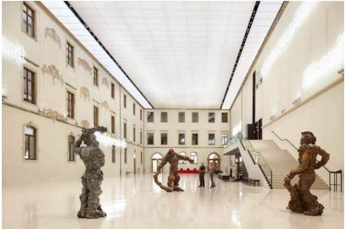
B3 | Een architectonisch meesterwerk is de nieuw overdekte binnenplaats van het Albertinum in Dresden. Met een intelligente lichtsturing en hoogwaardige spots van de firma Zumtobel ontstaan unieke ruimtelijke stemmingen.

for the purpose of advanced LED emergency lighting: owing to its high efficiency and ideal light distribution, few compact Resclite LED luminaires are sufficient to safely illuminate the exhibition areas in an emergency. Built into the Tecton trunking, they are barely visible. With a minimum installed load of 5 watts and a service life of 50,000 hours, they help the museum save ready cash.