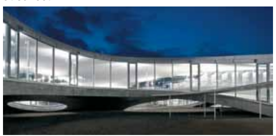
B7 I Rolex Learning Center from outdoors, showing rooms outwardly illuminated with pure white light