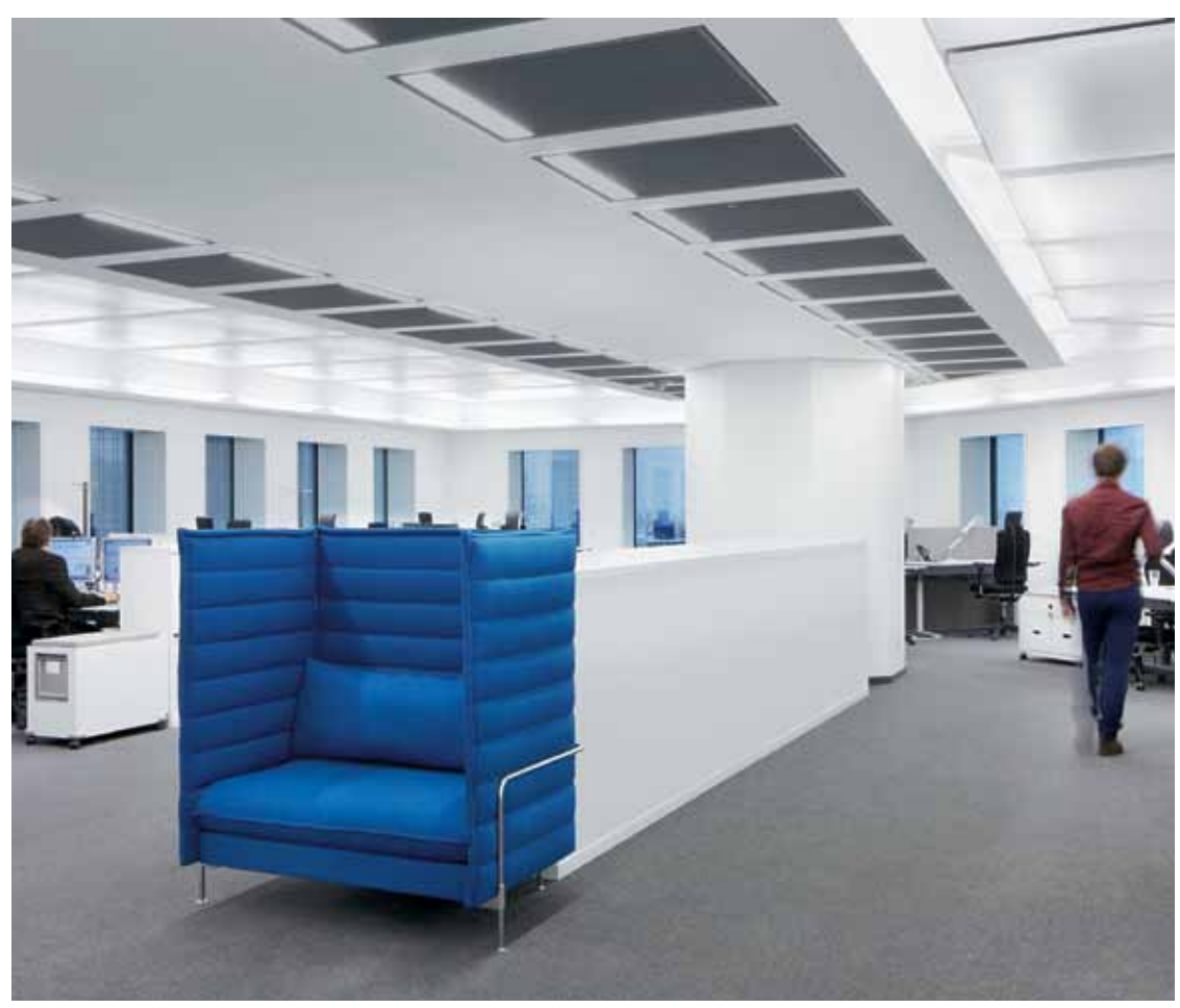
B2 I Deutsche Bank offices in Frankfurt equipped with a custom solution by Zumtobel