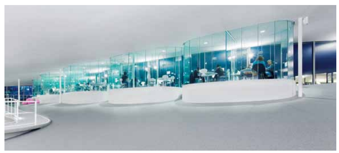
B5 I Offices/meeting "bubbles" for postgraduate researchers in the Rolex Learning Center