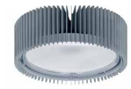
B3 I Module with cooling fins in the Panos Infinity LED downlight range

In the process, good colour rendering in a range from 2700 K to 6500 K not only improves perception, it also creates eye-catchers, highlights colours and works in harmony with human biorhythms. Besides Panos Infinity, Zumtobel also offers other luminaires in its product range with Tunable White functionality. This provides a variety of ways of using artificial lighting to mimic the natural changes in daylight over the course of a day, and opens up fresh possibilities for dynamic office lighting.