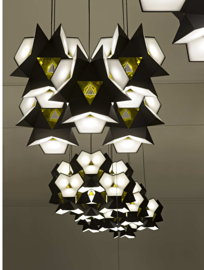
Picture 2: In collaboration with artist Olafur Eliasson, Zumtobel has developed the Starbrick Masterpiece.