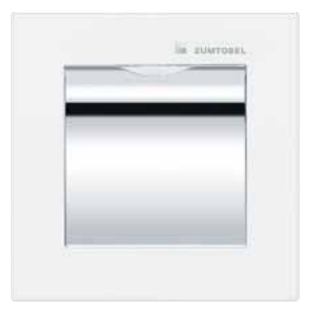
B6 I The rectangular counterpart to the small round RESCLITE emergency luminaires is mounted on the wall.