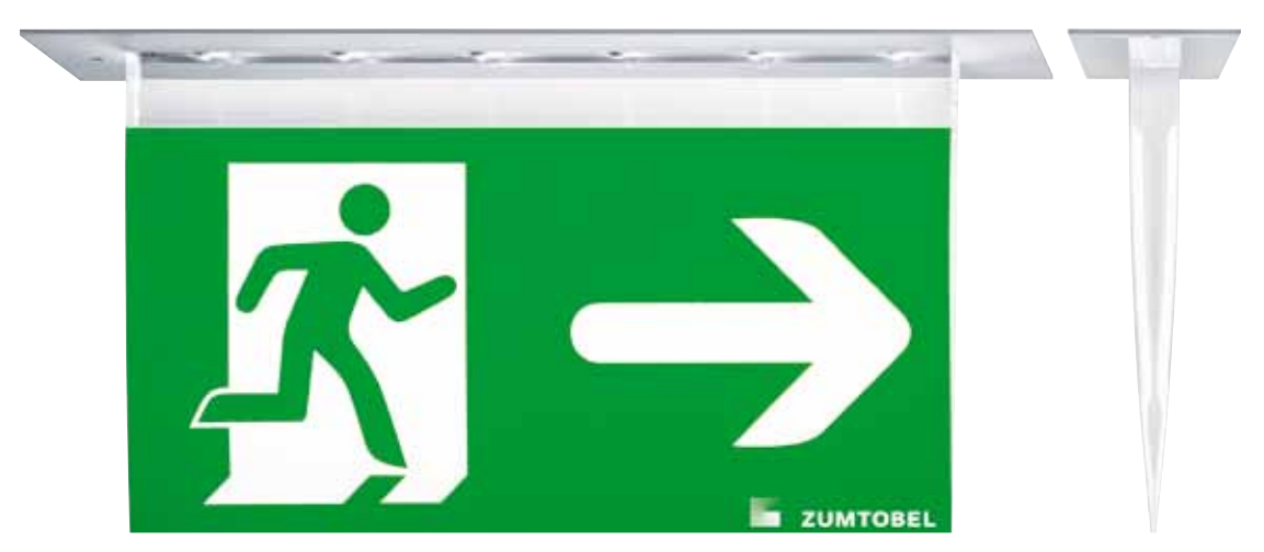
B4 I The COMSIGN II LED escape sign luminaire designed by Matteo Thun boasts an extra-long service life and low energy consumption.