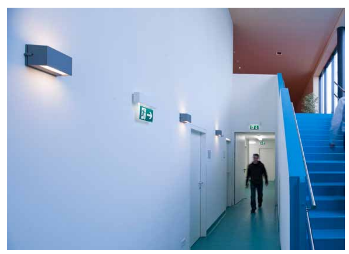
B1 I The true quality of an emergency lighting system becomes apparent not only in an emergency. Design, creative integration options and technical quality criteria, such as energy efficiency and maintenance comfort, play an important role as well.

The international Zumtobel premium brand, a subsidiary of the Zumtobel Group domiciled in Dornbirn, Austria, with a turnover of more than EUR 1.2 billion (2010/2011), provides integral lighting solutions involving high-quality luminaires and lighting management systems in numerous areas of application of professional interior lighting. Zumtobel's products combine excellent design and trend-setting technology in a harmonious way, triggering innovative impulses, with a focus on the brand's philosophy to create worlds of experience with light.