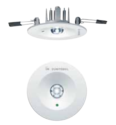
B5 I To prevent panic in an emergency, RESCLITE antipanic uniformly illuminates very large areas.

for escape route or anti-panic lighting. Within the escape sign luminaire portfolio you can choose between nine different product ranges: from small and delicate luminaires to extremely large ones for airports or extra-large halls with recognition ranges of up to 90 metres. All luminaires are characterised by minimum energy consumption, both in normal operation and during emergency operation. Moreover, we also supply luminaires for harsh environmental conditions. All luminaire ranges and design versions are available for all types of supply: for individual battery, group battery or central battery systems. In other words: we cover pretty much any conceivable application area of emergency lighting in conformity with relevant standards.