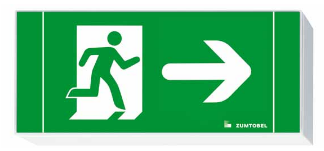
B2 I The volume of the ERGOSIGN LED surface-mounted luminaire has been reduced by two thirds as compared to the previous model. The recessed version of the escape sign luminaire fully disappears into the wall.