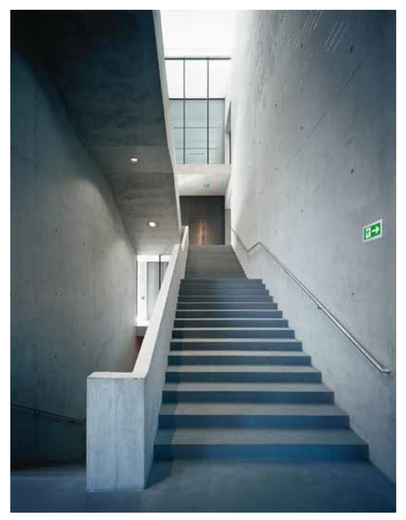
B3 I High-quality aluminium enhances the look and prolongs the service life of the ARTSIGN escape sign luminaire.