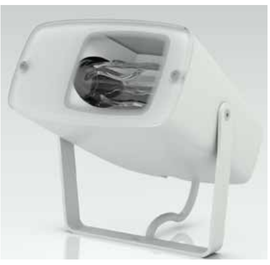
B2 I Aphrodite LED biorhythm spotlight

The new Aphrodite LED biorhythm spotlight shows off the benefits of LED technology by creating special atmospheres. With the new LED spotlight, exciting colour and brightness sequences and hence dynamic lighting scenes can be created.