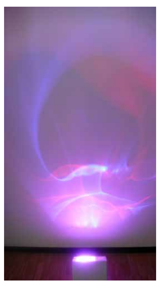
B3 I The Aphrodite LED biorhythm spotlight produces exciting ever-changing sequences of colours.