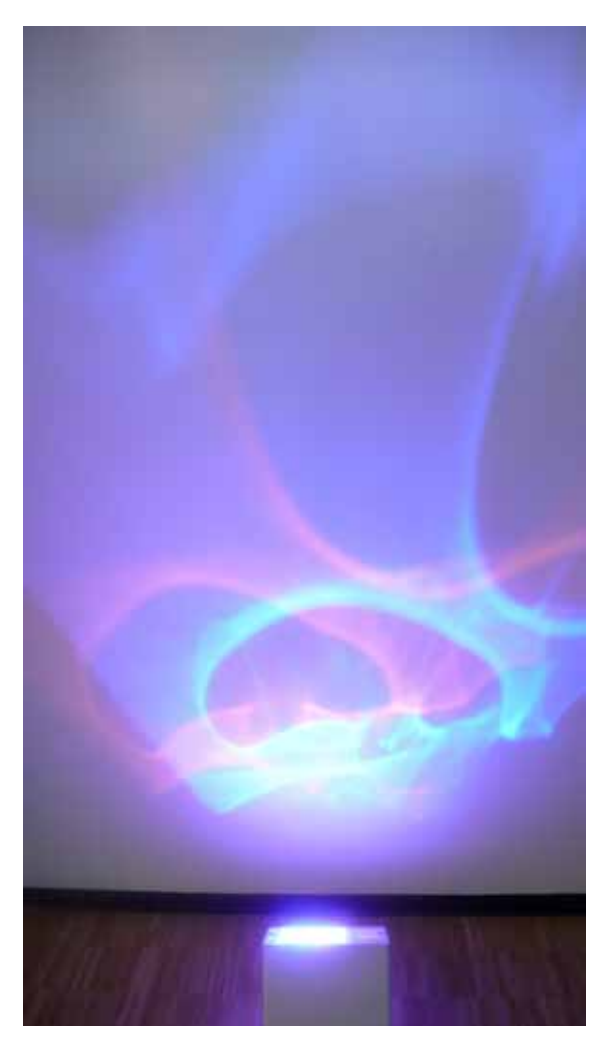
B1 I Perfectly harmonious design and lighting effects: the Aphrodite LED spotlight developed in collaboration with designer Nik Schweiger uses gently changing light colours to create natural atmospheres.