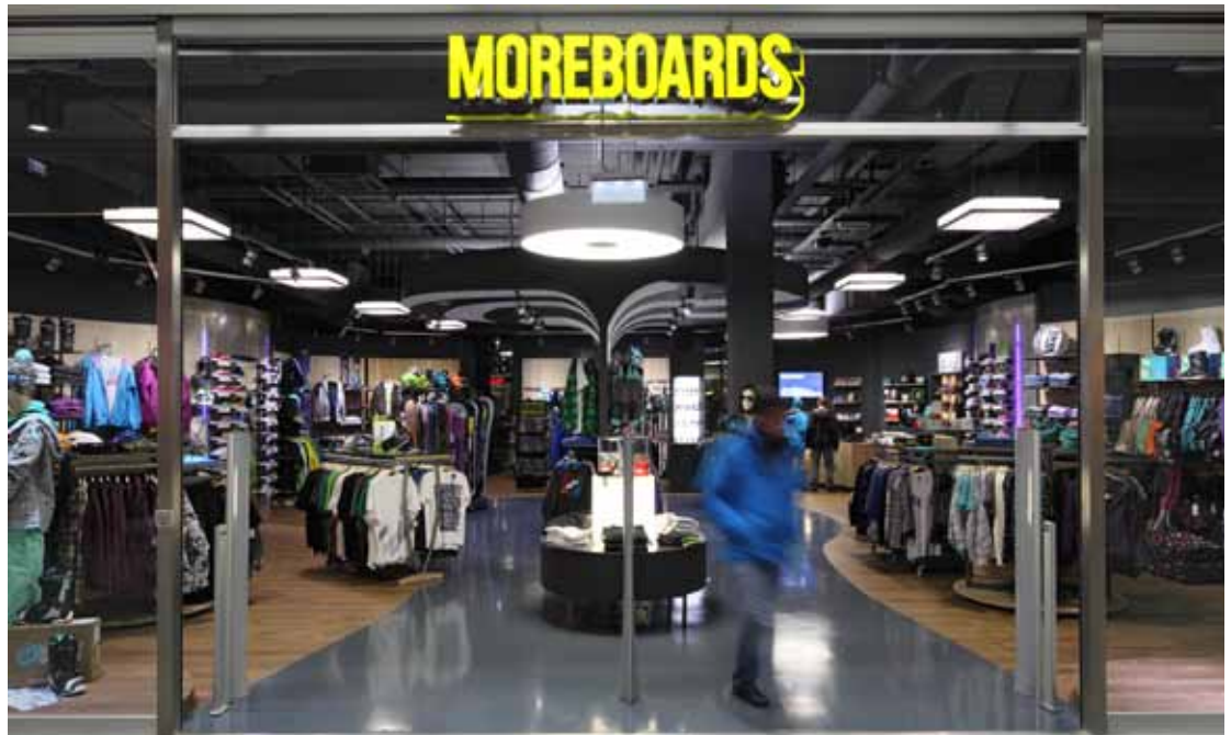
B1 | Cool lighting for the Moreboards store in Kufstein/Austria: LED luminaires provide brilliant light, with high flexibility in the choice of colours available.

Well-known to snowboard and skateboard lovers: the Moreboards company runs more than 15 stores in Austria, where aficionados will find everything around the trendy sports of snowboarding and skateboarding. With its new branch in Kufstein, Moreboards has also set standards in terms of saving resources. For the first time, the complete lighting system has been implemented using LED luminaires – including a Luxmate Emotion control system. In retail areas in particular, luminaires need to have a long service life, for this makes complicated and costly replacement and storage of lamps redundant. Boasting an average service life of 50,000 hours, LED luminaires are the perfect solution for this application. Free from any UV and IR radiation, the light emitted