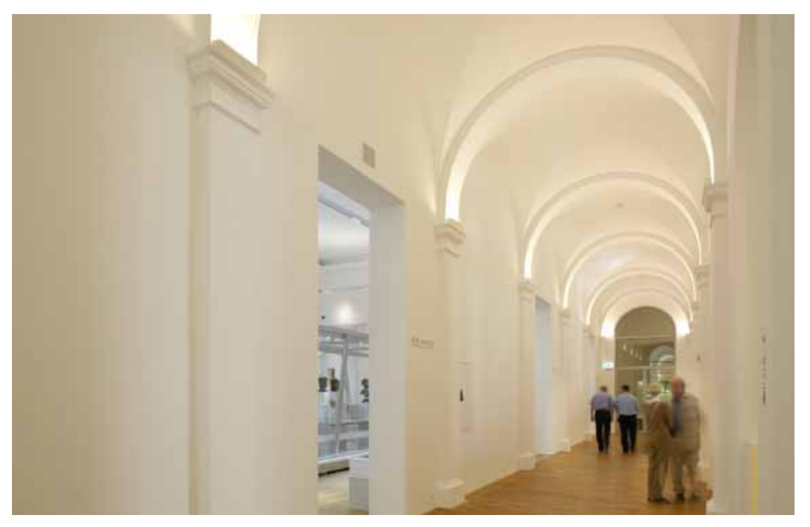
B2 I Discreetly built-in special luminaires provide attractive indirect illumination of the corridor ceilings.