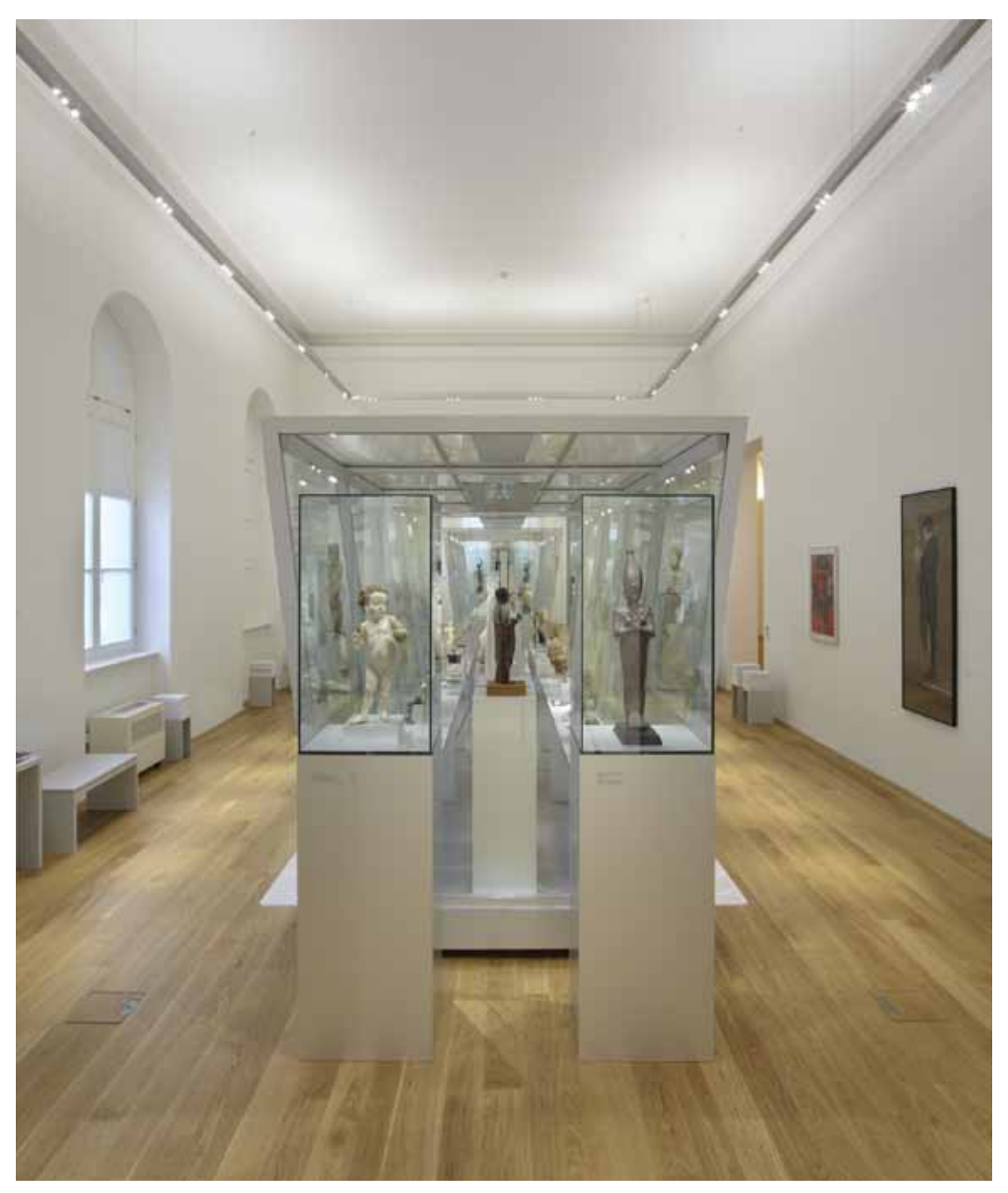
B1 I Art inviting you to explore further. Pleasant ambient lighting is created by indirect illumination of the ceiling. Thanks to the Supersystem's focussed LED spots, exhibits can be put centre stage – without any harmful UV radiation.