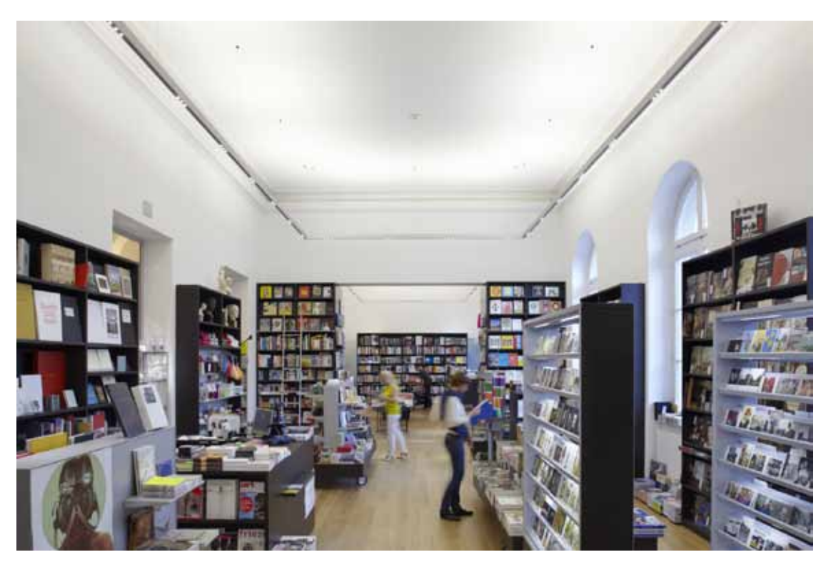
B4 I Large glass doors and a consistent lighting concept using the Supersystem link the adjoining book store with the museum foyer.