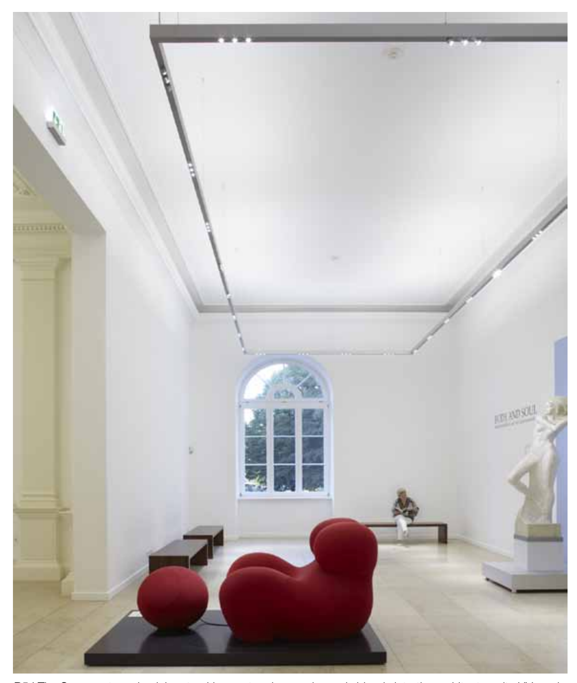
B5 I The Supersystem aluminium trunking system inconspicuously blends into the architecture, its UV- and IR-free light ensuring gentle illumination of the exhibits.