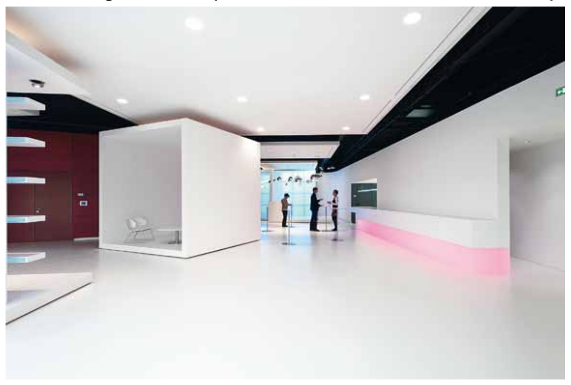
B1 I After its redesign, the Lemgo Light Forum now welcomes visitors with a bright and pleasant ambience.

Zumtobel has invested around EUR 750,000 in a comprehensive makeover of its Light Forum in Lemgo, following on from last year's modernisation of its local production operations. The Light Forum – among the largest of Zumtobel's 16 Light Forums and Centres worldwide, with a display area of 1,400 m2 – unveiled its brand new look yesterday evening with the launch of Re-Balancing, an exhibition by Vienna-based design company EOOS.