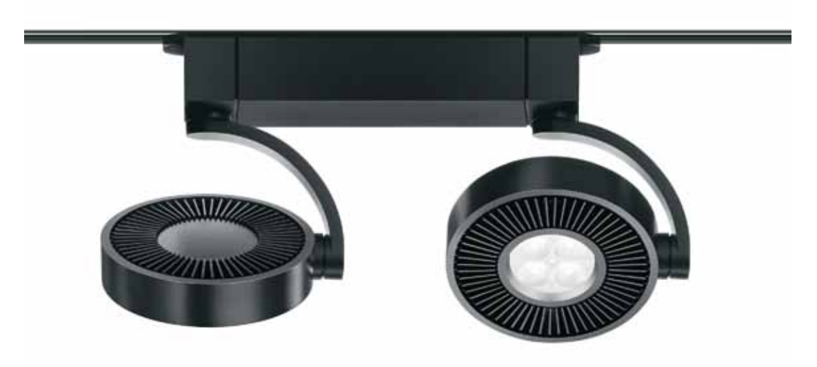
B4 I At the Light Forum, the lighting effects and lighting quality produced by numerous product innovations, including the Discus LED spotlight, can be closely examined by customers and visitors.