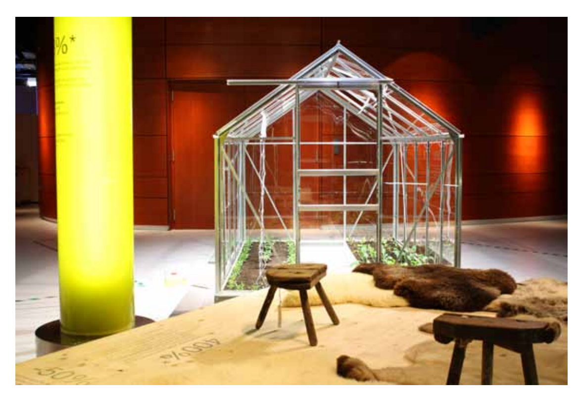
B5 I On the occasion of the re-opening of the Zumtobel Light Forum, the "Re-Balancing" exhibition of the Vienna-based EOOS design studio will be open to visitors until 29 April.