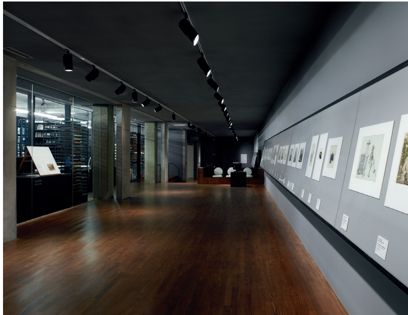
B3 | Soft light and gentle illumination: Arcos spotlights (wallwasher models) carefully highlight the precious paintings on display at the Boijmans Van Beuningen Art Museum in Rotterdam.