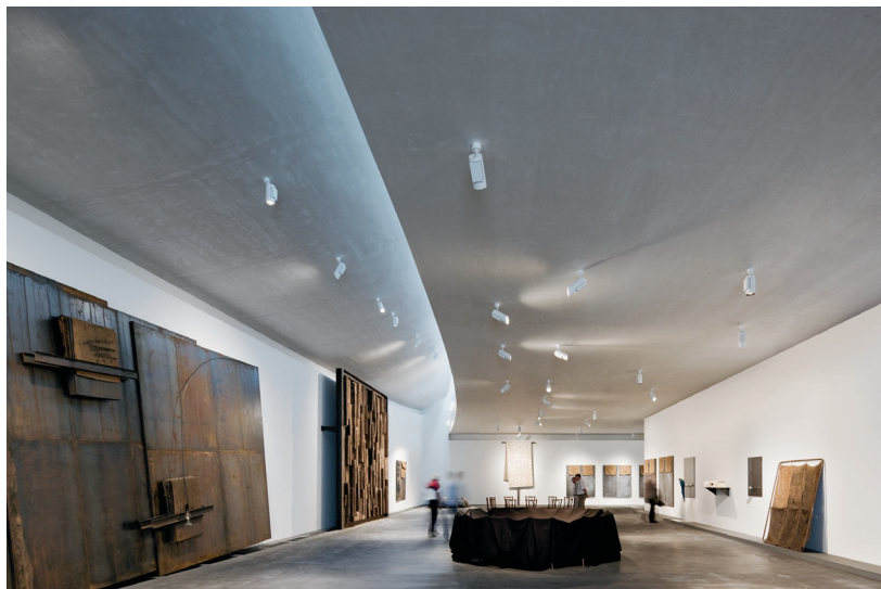
B4 | Enjoying art at the HEART Herring Museum of Contemporary Art: the Arcos spotlight's sophisticated lighting technology provides illumination without casting any shadows, ensuring conservational lighting of the art objects. Thanks to the spotlights' colour selection, the lighting solution fades into the background, blending perfectly into the architecture.