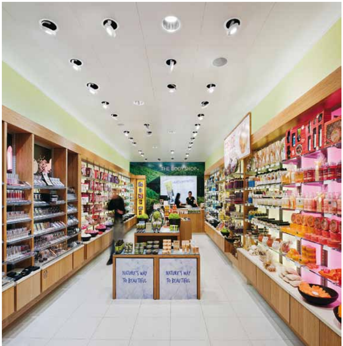
B1 | Warm colours and pleasant lighting provide a feel-good atmosphere for the customers of “The Body Shop” in Emmen.

The “Body Shop” chain of cosmetics stores makes a point of keeping to environmentally compatible and sustainable methods in manufacturing their product lines. In doing so, the international brand relies on naturalness, not only when it comes to cosmetics. The company puts the focus on eco-friendly aspects with respect to shop fitting and illumination as well. Recently, the first shop concepts featuring a Zumtobel lighting solution completely based on LEDs have been implemented in Emmen, Zug and