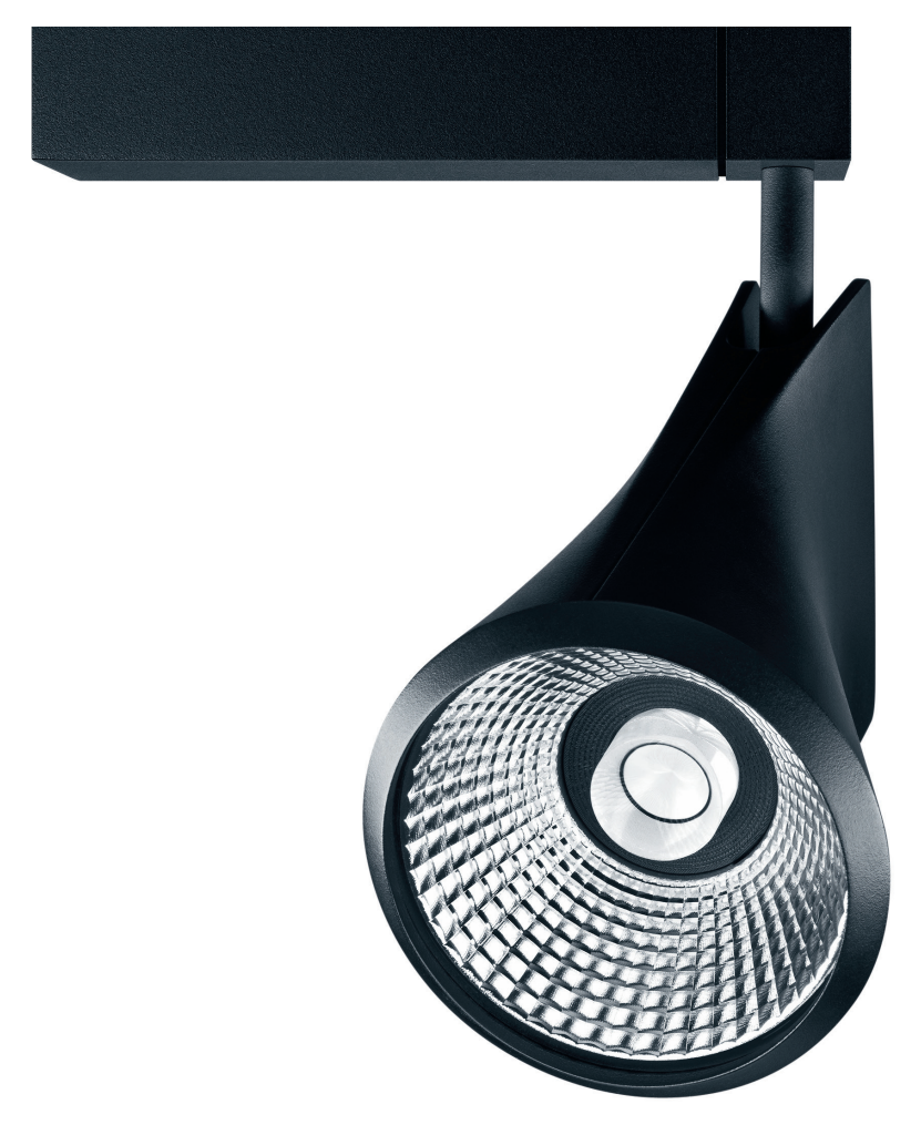
B2 I With its sophisticated design and unique lens/reflector system, the Iyon LED spotlight introduces new options for lighting retail areas.