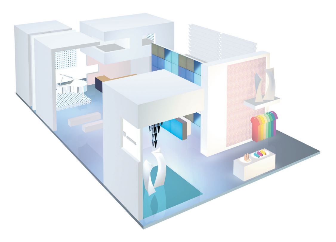
B1 I Design, innovation and efficiency, presented in a context: based on the respective application, Zumtobel will present current LED products at Euroluce.

12 to 17 April 2003 Strada Statale del Sempione, 28, 20017 Rho (Milan)