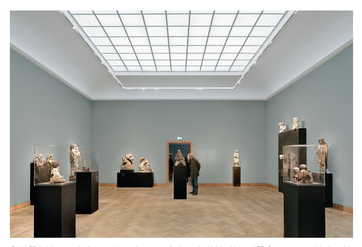
B4 I LED lighting puts the focus on the sculptures on display at the Liebieg House. LED Superspots provide the exhibits with high-precision accent lighting and sufficient brightness without outshining them.