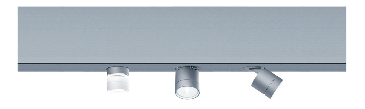
B1 I Multifunctional and going easy on resources: Supersystem is the perfect solution for complex lighting tasks. The Supersystem 3-circuit LED lighting unit can be mounted onto all standard 3-circuit tracks.

Using Zumtobel's multifunctional Supersystem lighting system, complex lighting solutions can be implemented in a design that is reduced to pure functionality. The system cannot fail to impress on account of its resource-efficient use of materials in combination with lighting comfort of outstanding quality. Recycled aluminium boasting an especially beneficial energy balance is used for the track system and spotlights. Highly efficient LEDs with a service life of approximately 50,000 hours allow energy-efficient illumination, also in rooms with high ceilings.