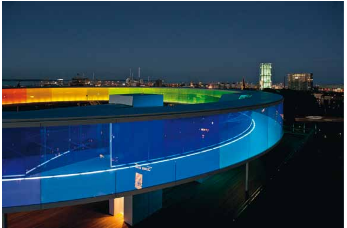
B1 | The panoramic walkway “Your rainbow panorama” with coloured glass walls is illuminated by a special solution provided by lighting solution expert Zumtobel.