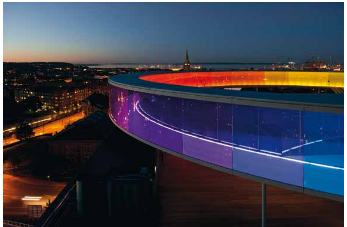
B2 | Special uplights recessed into the floor make the unique installation glow in all colours of the spectrum – just like a real rainbow. For this purpose, the ceiling is symmetrically illuminated, so that the coloured glass panels seem to radiate colours from inside.