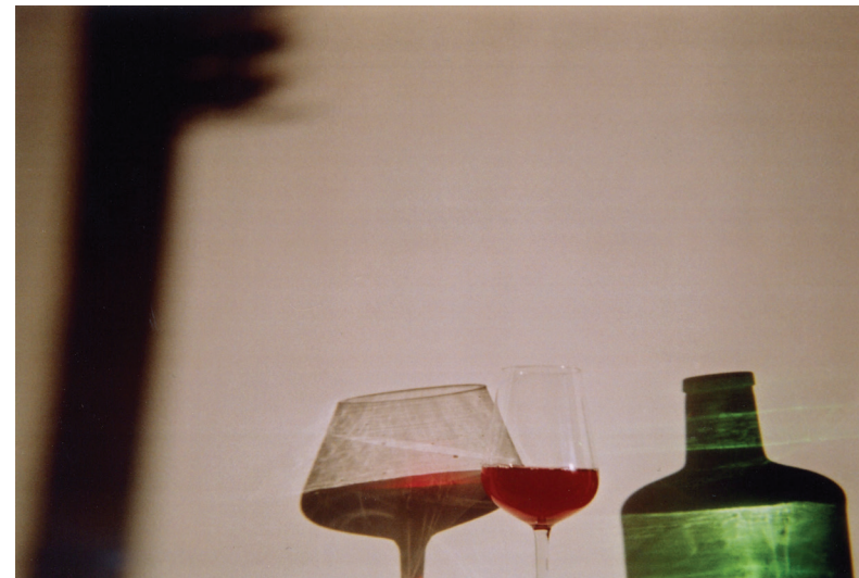
Gosia Niedzwiedzka HCLA London

"This picture was taken in my apartment in London on a very pretty sunny afternoon. I noticed a warm sunlight, passing through the bottle and wine glass projecting the strong, sharp and colourful shadows on the wall. I found it amazing and inspiring and really wanted to capture the moment - particularly the intriguing light and shadows".