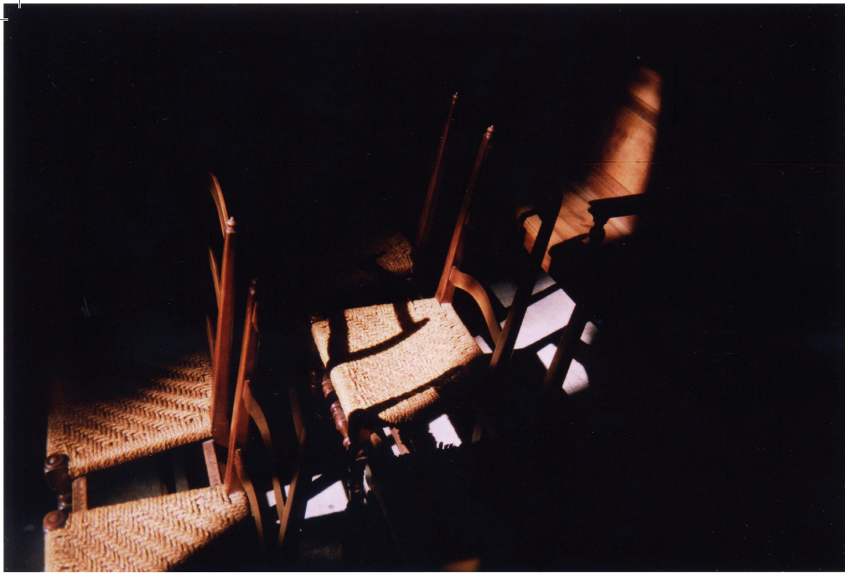
2 nd Cora Kwiatkowski Stride Treglown Bristol

"I took the photo in the Cathedral of Notre Dame in Lausanne, Switzerland, where I lived as a student and this gothic building always fascinated me. Rows of wooden chairs were lined up in the side aisle with the light streaming through the tall windows. The chairs momentarily