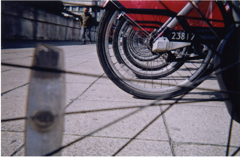
Clive Seymour PDP London