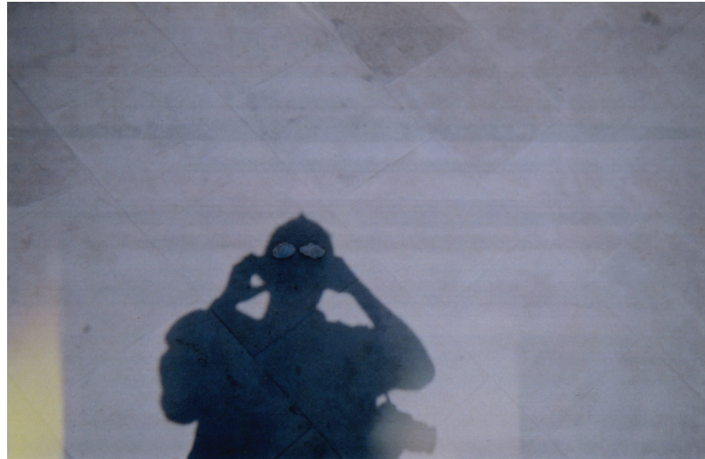
Nigel Vogel EPR London