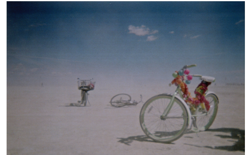
Warwick Hemingway Gensler London