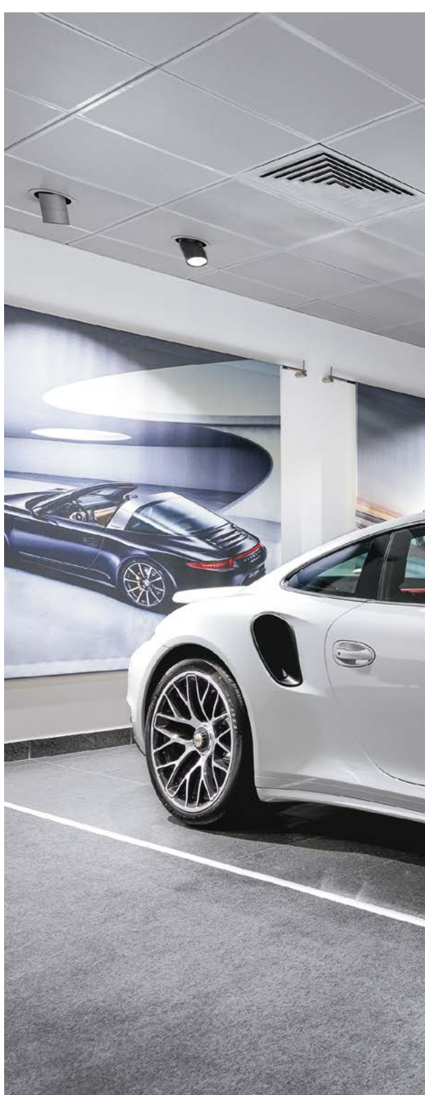
The VIVO spotlight helps enhance the natural appearance of the luxurious cars.

The OPURA freestanding luminaire ensures uniform illumination of the task areas whilst also giving employees the option to easily adjust the light levels. The asymmetric indirect light distribution provides optimum visual conditions by directing light onto the working plane and delivering uniform illumination of the ceiling.