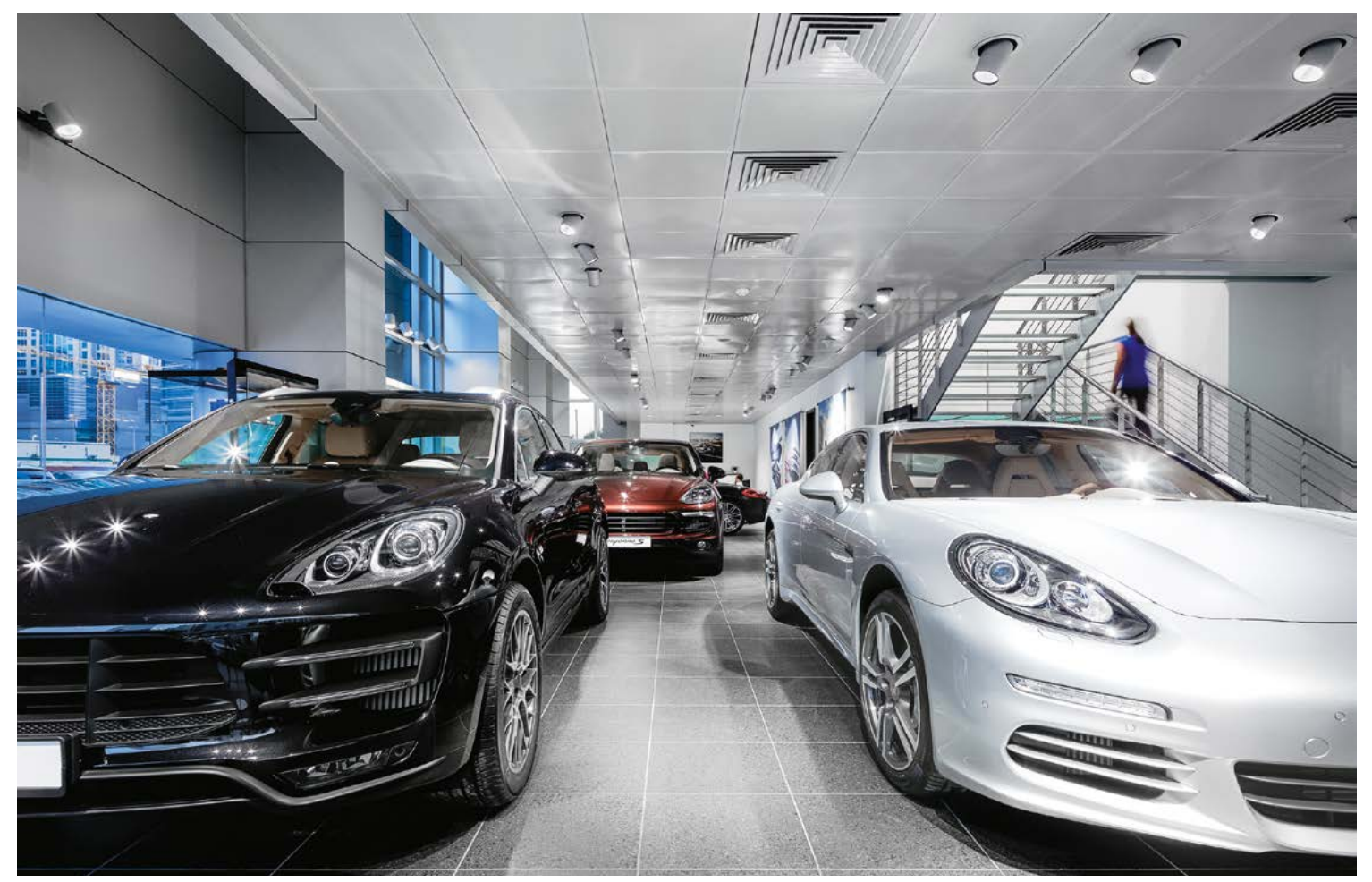
Integral lighting solution with high efficiency.

In the course of day-to-day work in office applications, it is quite normal to encounter a huge variety of different visual stimuli. This means that achieving the right lighting concept is crucial. Light affects almost all vital processes in the human body and also has an impact on our performance, health, safety and sense of well-being. The office study conducted by Zumtobel with Frauenhofer IAO found that people clearly prefer different light levels and colour temperatures. The research also demonstrated that direct/indirect lighting and individual controls are important for many office users. The Porsche offices located within the showroom area take all of these factors into account with one single luminaire.