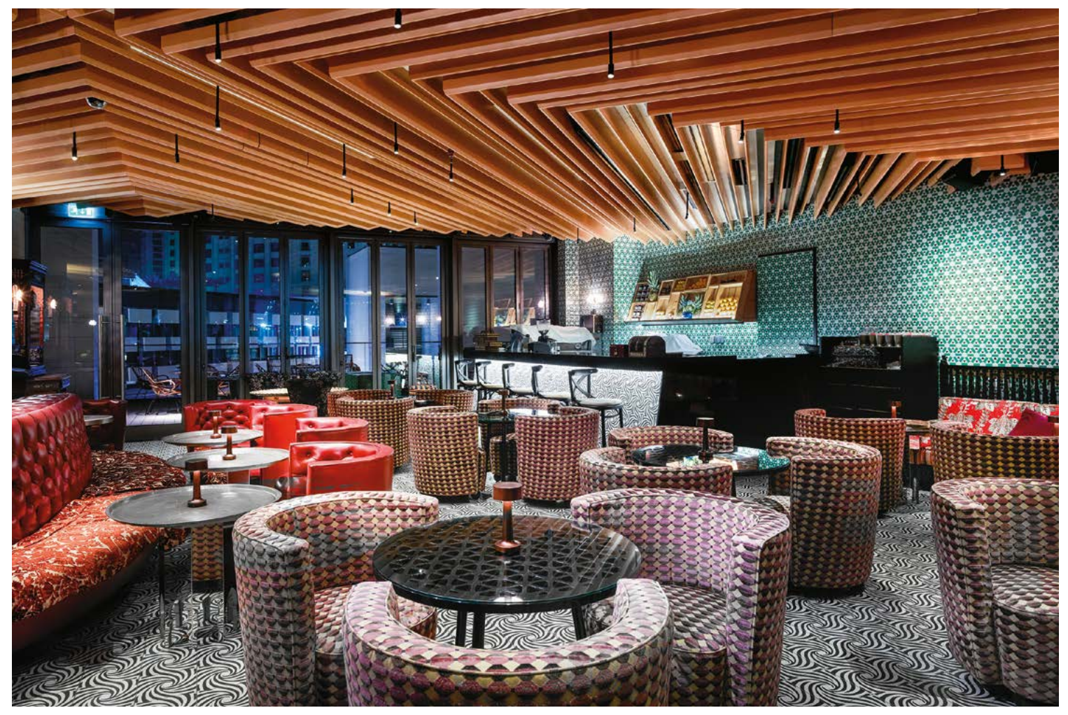
The Stylish SUPERSYSTEM units look like fireflies glancing out of a tree.