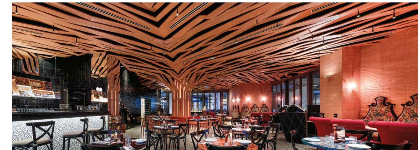
SUPERSYSTEM compliments the architectural framework of Almaz, creating a scenic environment.

LUXMATE PROFESSIONAL ensures easy control of the lighting solution throughout the restaurant. CLEAN provides excellent lighting in the kitchen, whilst PANOS infinity and MICROS deliver general lighting in the back-of-house areas.