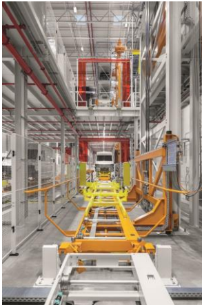
Photo 1: Volkswagen Commercial Vehicles manufactures the latest generation of the VW Crafter and the similar TGE model from MAN at the factory in the Polish city of Wrzesnia. The plant covers an area of around 220 hectares and has the capacity to produce up to 100,000 vehicles per year.