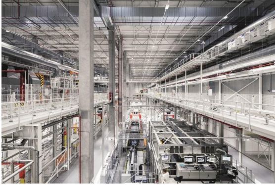
Photo 4: Based on 15,000 continuous-row 40W LED luminaires and 6000 operating hours, Volkswagen Commercial Vehicles is now saving 3420 MWh and 1920 tonnes of CO 2 each year at the factory in Poland.