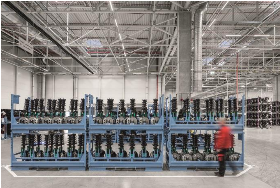
Photo 5: A full LED solution has helped establish the factory as the worldwide most efficient building in the Volkswagen Group.

Photo 4: Based on 15,000 continuous-row 40W LED luminaires and 6000 operating hours, Volkswagen Commercial Vehicles is now saving 3420 MWh and 1920 tonnes of CO 2 each year at the factory in Poland.