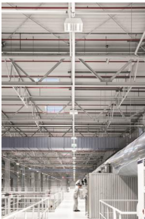
Photo 3: The CRAFT L high-bay solution is installed in the paint shop and higher halls.

Photo 2: A total of 16,000 TECTON luminaires are installed in the factory on trunking that covers a distance of around 40 kilometres.