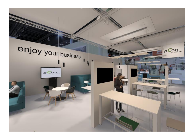
Bild 4: The joint stand of Easterngraphics and Zumtobel can be visited virtually before the fair: <a href="https://vivaldi.zumtobel.com/data/360/Orgatec_Fair/">https://vivaldi.zumtobel.com/data/360/Orgatec_Fair/</a>

Image 3: LINETIK challenges the accepted principles of office lighting and yet still manages to simultaneously integrate perfectly into any office environment.