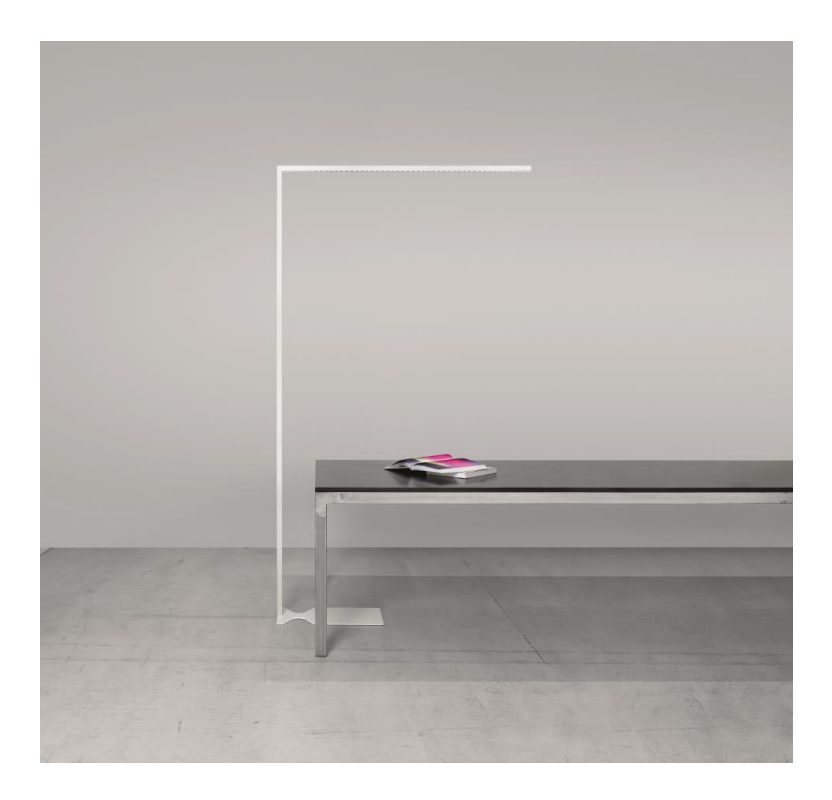
Image 3: LINETIK challenges the accepted principles of office lighting and yet still manages to simultaneously integrate perfectly into any office environment.