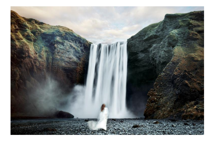
Image 1: Nothing is as vibrant as white, natural light – the role model for the dynamic and powerful emotional quality of tunableWhite.