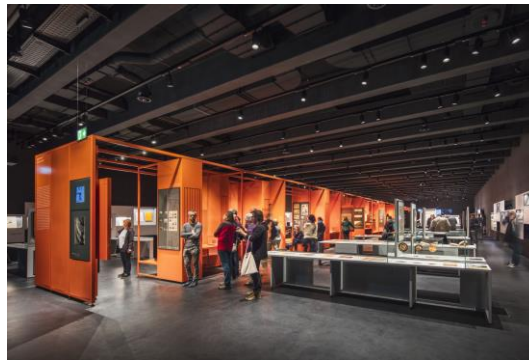
Image 2 + 3: The ARCOS spotlight system provides accented, precise and authentic staging of the exhibits and exhibition architecture.