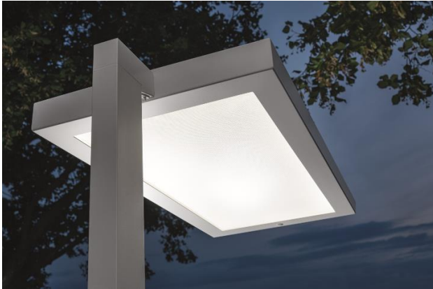
Photo 6: Developed for demanding tasks and a wide range of requirements, EPURIA is the perfect addition to any office environment.