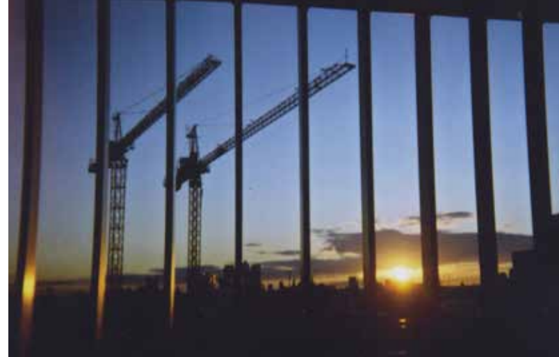
Sidney Zindere Archimode Studio London