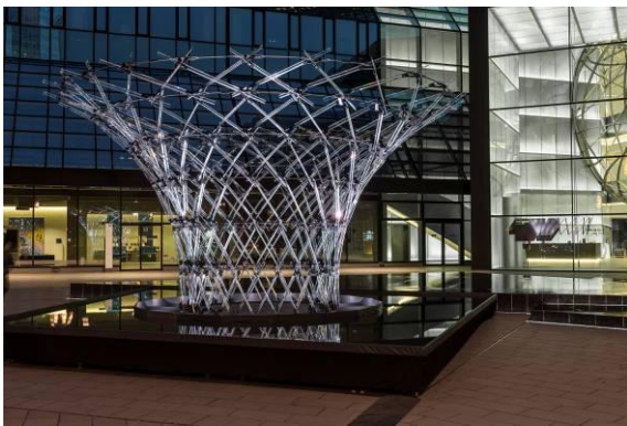
Caption 4-5: The Twinkle structure symbolises transparency and communication. Light is transmitted and transformed by 576 unique glass poles radially arranged to create a dynamic spatial system.