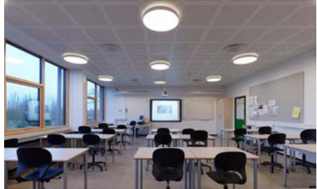
500 lx / 5000 K 500 lx / 3000 K 420 lx / 4000 K

Ceiling luminaires Board luminaires Wall washers